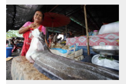
Although fish catch has declined along the Hinboun River following THPC operations, large fish are still caught and traded locally.